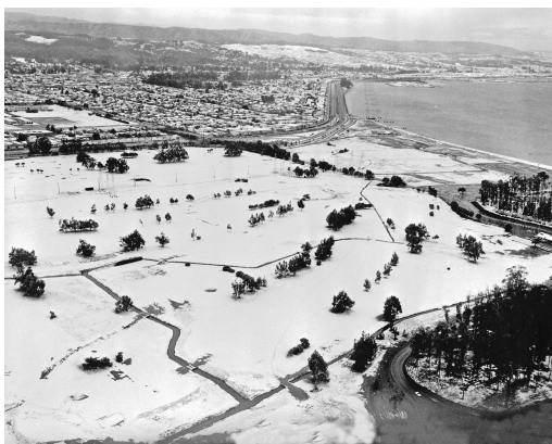
Poplar Creek Golf Course in Snow 1962