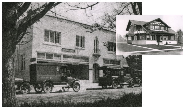
Above: The commercial building that currently houses “Nuts for Candy” and a home once located at 1145 Laguna Avenue