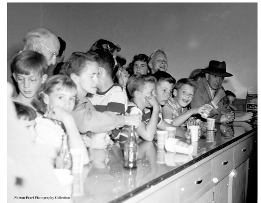
Opening day at the Rec Center 1949