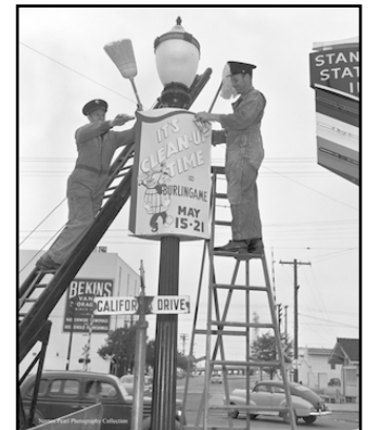
Burlingame City Dump, formerly located at 1101 Airport Blvd. in 1963, and citywide clean-up drive sign on Broadway in 1949