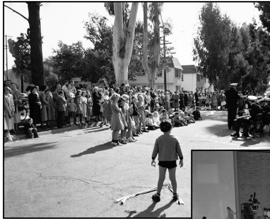
Above - crowds enjoy entertainment at the entrance. At right- teens try out the dance floor. Below- brownies listen with joy to the juke box.

This early experience, together with extensive freelance work done for San Francisco newspapers while concurrently earning his Business Administration degree from San Jose State, led to work for United Press Photos. His talent was subsequently sought by a San