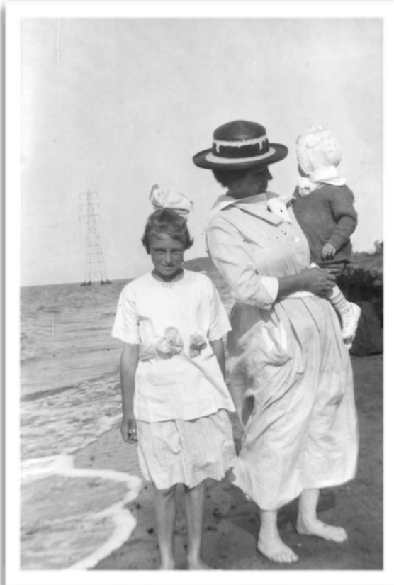
Above left and below: Bathers enjoy Coyote Point around the turn of the 20th century