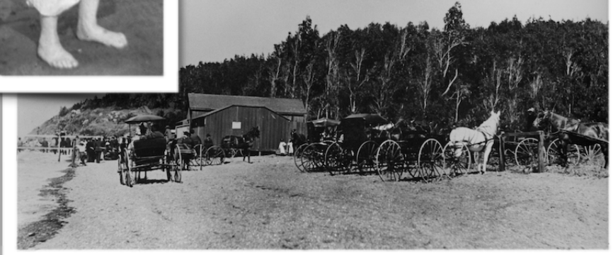
The Pacific City amusement park at Coyote Point was short-lived due, in part, to the unpleasant odors of raw sewage flowing into the Bay just north of the park