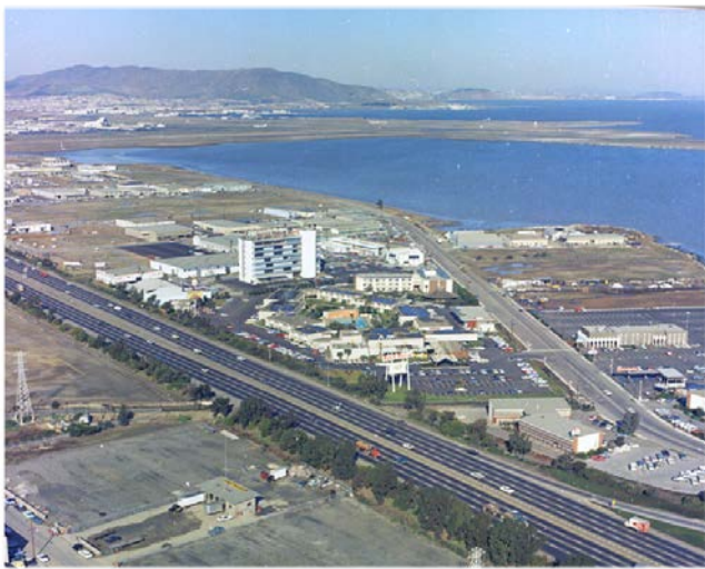
Bayfront in 1966